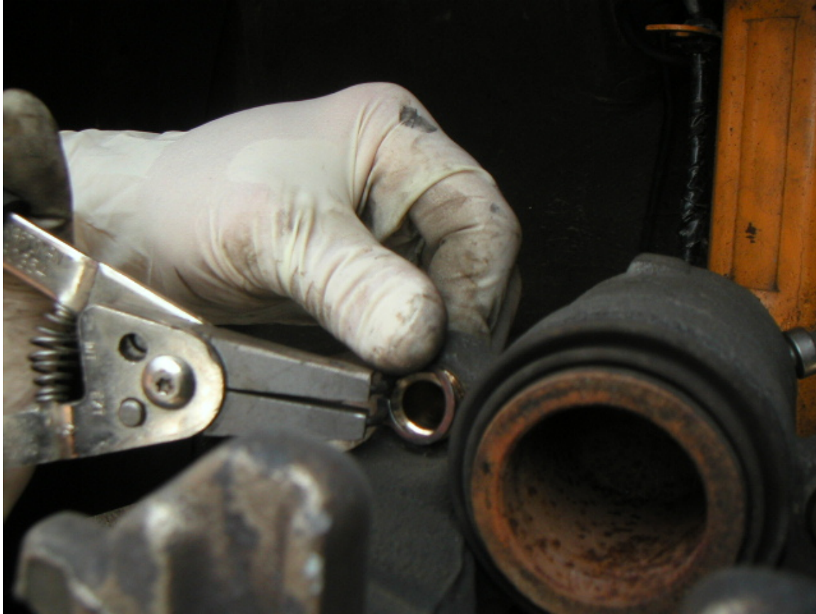
Snap ring in place

Using snap ring pliers or similar, guide the snap rings over the guide sleeves to lock them into place.